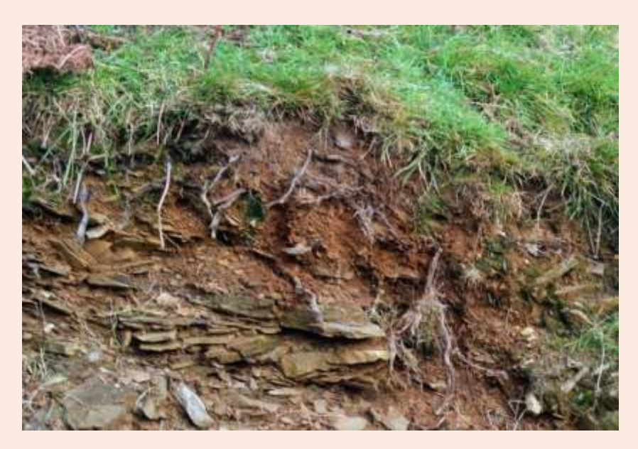
Shallow Manod profile