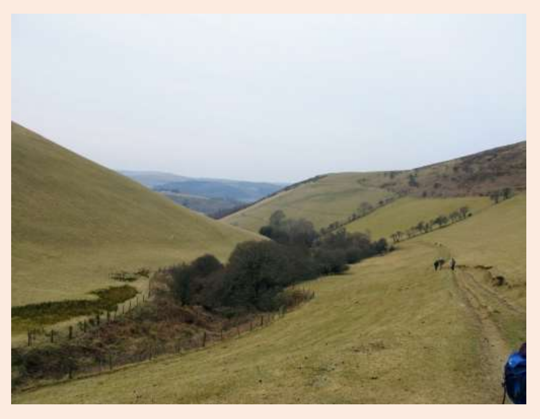
A typical Welsh landscape for Manod soils

It is recommended that a full ecological and soil survey of sites on these soils be made before significant land-use changes are attempted. Special attention should be given to slope, and variability of soil depth to bedrock or scree, and the presence of rock outcrops and cliffs. The organic matter content of the topsoils and upper subsoil should be recorded, as well as the pH of all horizons.