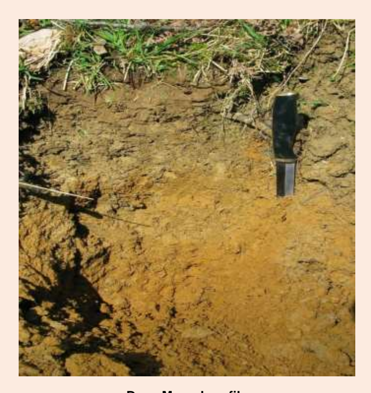
Deep Manod profile